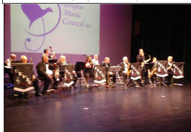
Dandenong Ranges Hot Jazz Orchestra