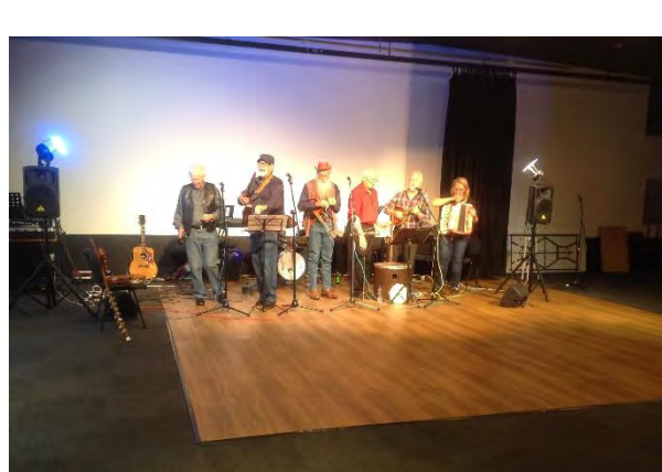
The Soopa Doopa Bush Band