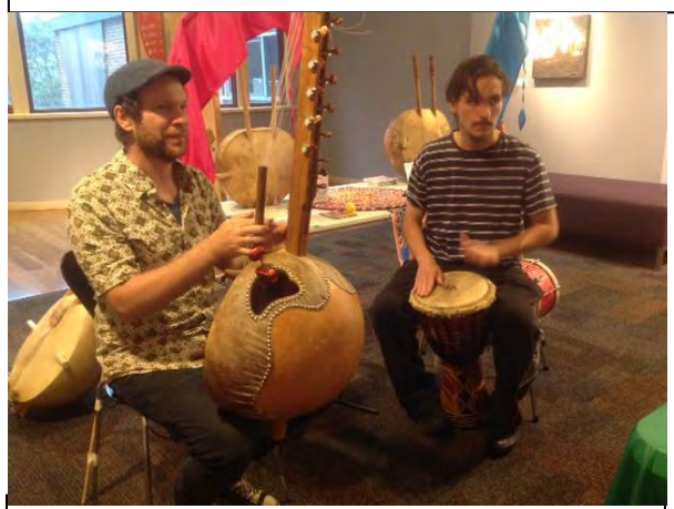
Full Circle Drumming African Harps

Funded by Yarra Ranges Council Community Festival Grant 2017