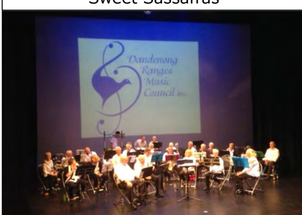
New Horizons Concert Band