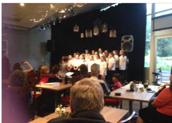
Tecoma Primary School Choir