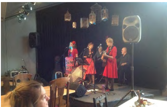
The Jam Tarts