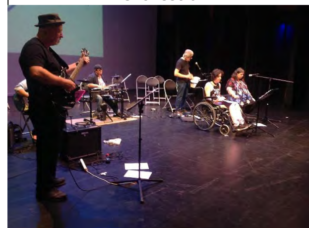
Ad Hoc Band