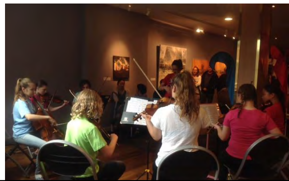
Ranges Young Strings