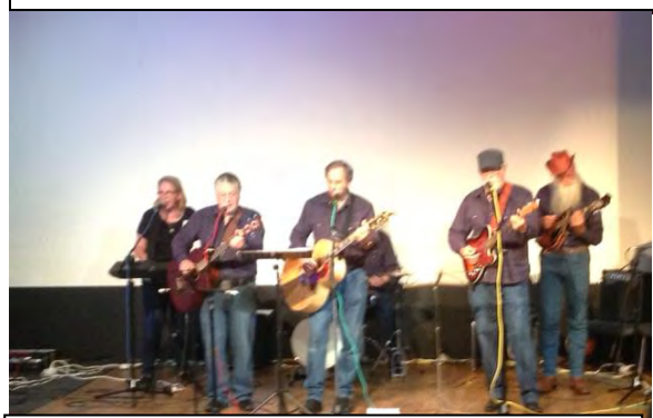
The Up Country Band